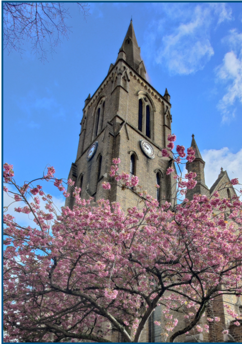
The tower houses Queen Victoria's Diamond Jubilee Clock (1897)

Holy Trinity Church is probably unique in the UK. It was built to serve the military in two barracks and also the local community in its own parish, which stretched down to the banks of the Thames and the Castle.