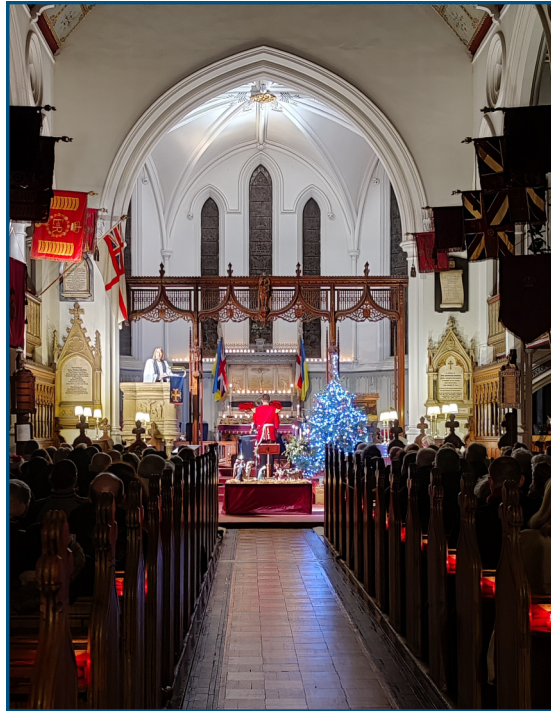
Carols by Candlelight

To be a Friend of the Holy Trinity is to be part of a community of people who love and care about this fascinating building and its fellowship. We link together those who want to show their support by joining in events and directly giving through subscriptions, donations and legacies.