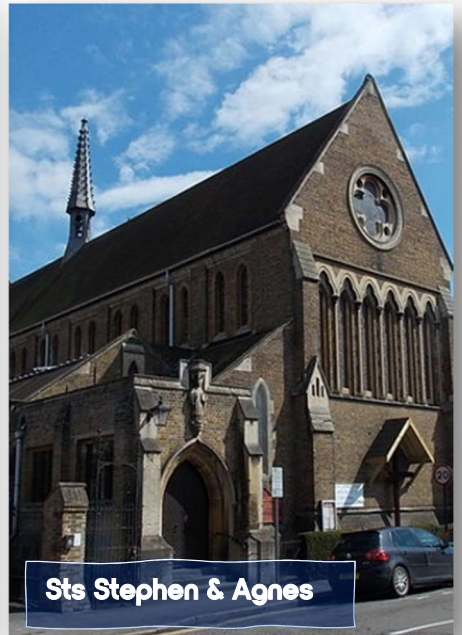
Sts Stephen & Agnes